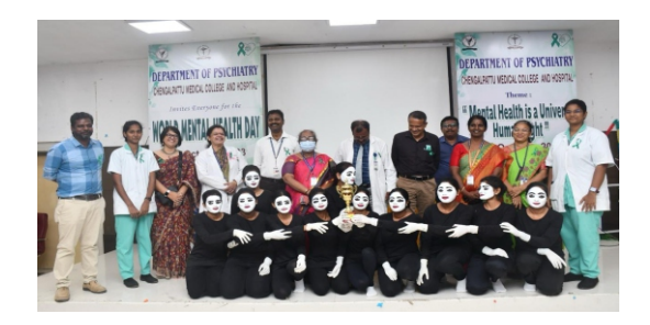
Awareness Mime conducted on the occasion of World mental health day 2023, by Department of Psychiatry, at Chengalpattu Medical College and Hospital.