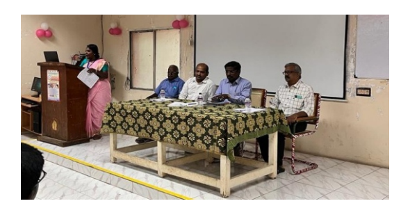
MHRB of Erode & Namakkal districts conducted a meeting with the owners / Incharge of MHE.