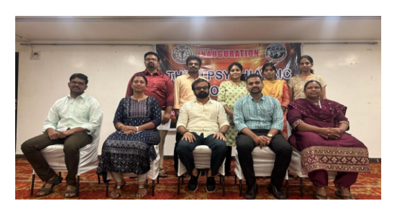
Member Psychiatrists at the Inaugural ceremony of Theni Psychiatric Society, Theni.