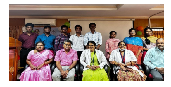
World mental health day 2023, special event conducted at KAPV Government Medical College, Trichy.